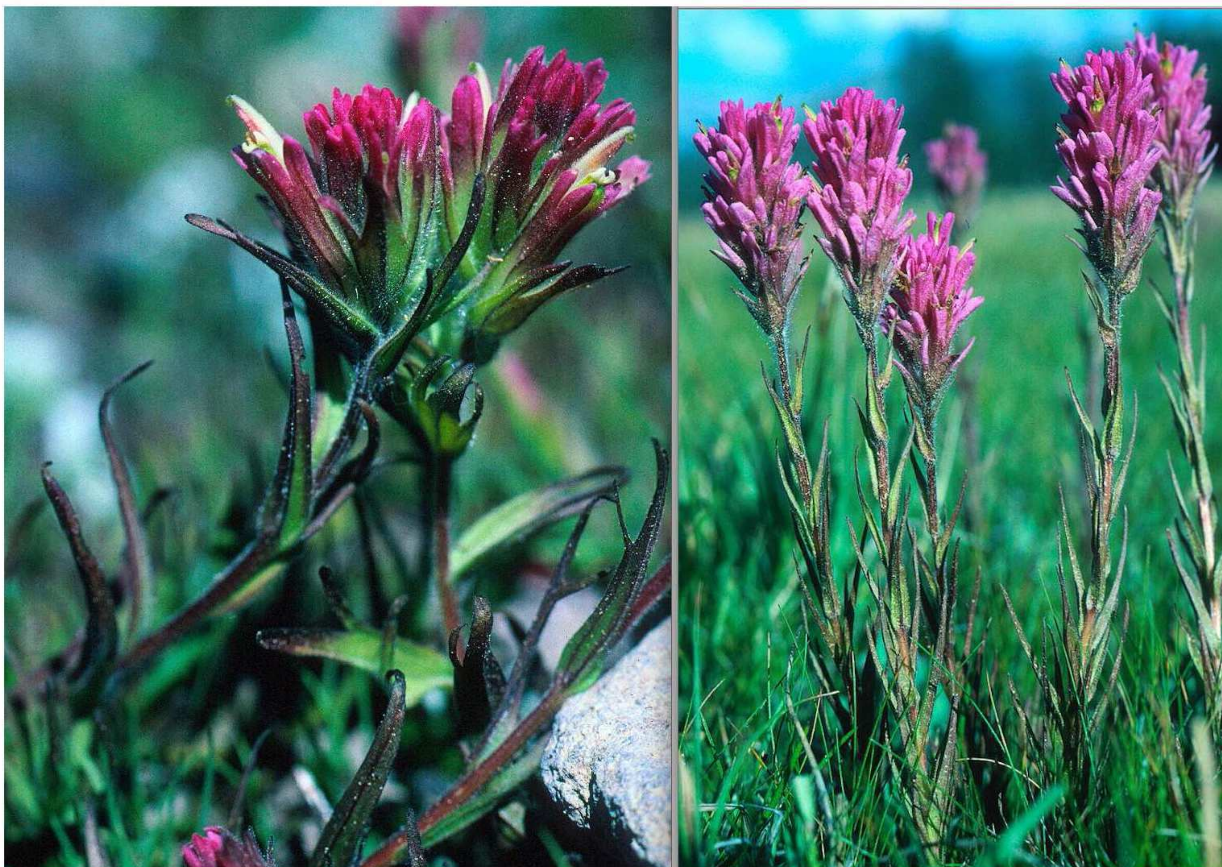
Figure 10. Castilleja lassenensis (left), Emerald Lake, Mt. Lassen National Park, Shasta Co., California, 11 Jul 1997, and C. lemmonii, Sierra Nevada form (right), Tuolumne Meadows, Yosemite National Park, Tuolumne Co., California, 7 Aug 1993.